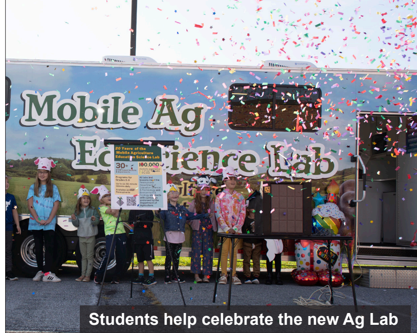
Students help celebrate the new Ag Lab